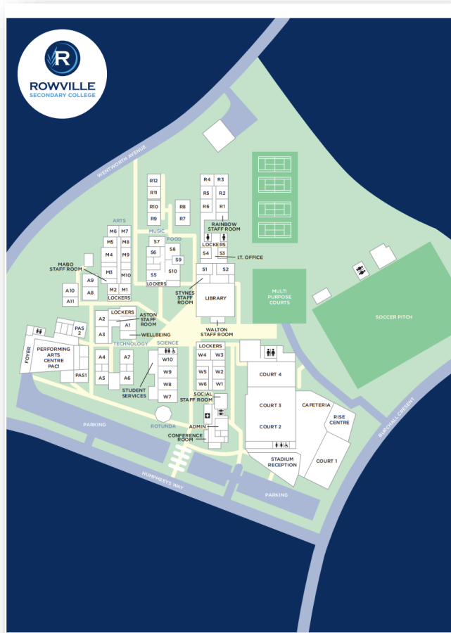
ROWVILLE SECONDARY COLLEGE - EASTERN CAMPUS